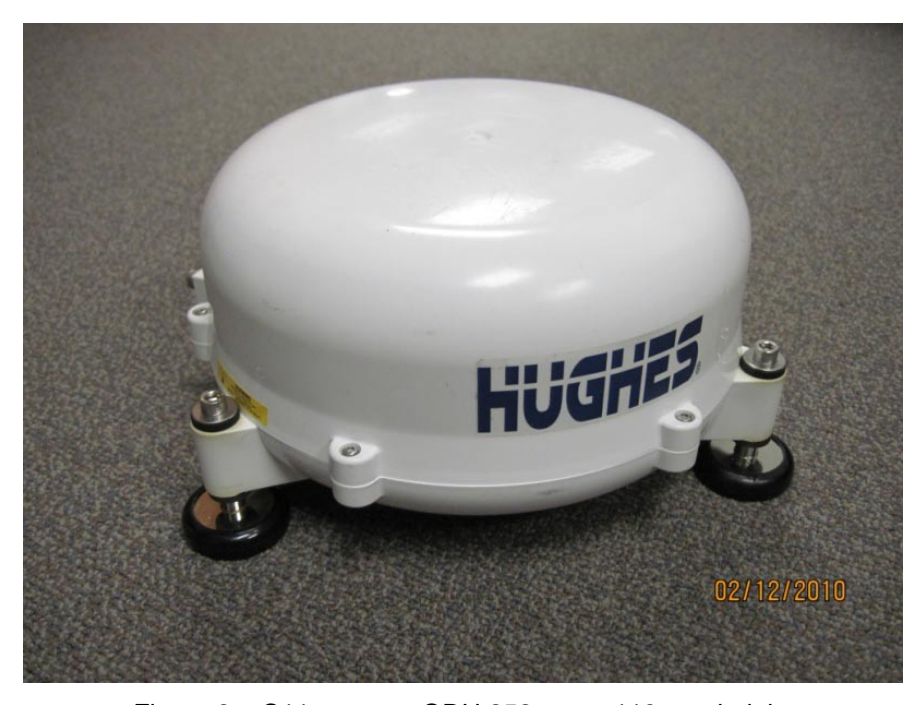
Figure 8. C11 antenna ODU 252 mm x 119 mm height