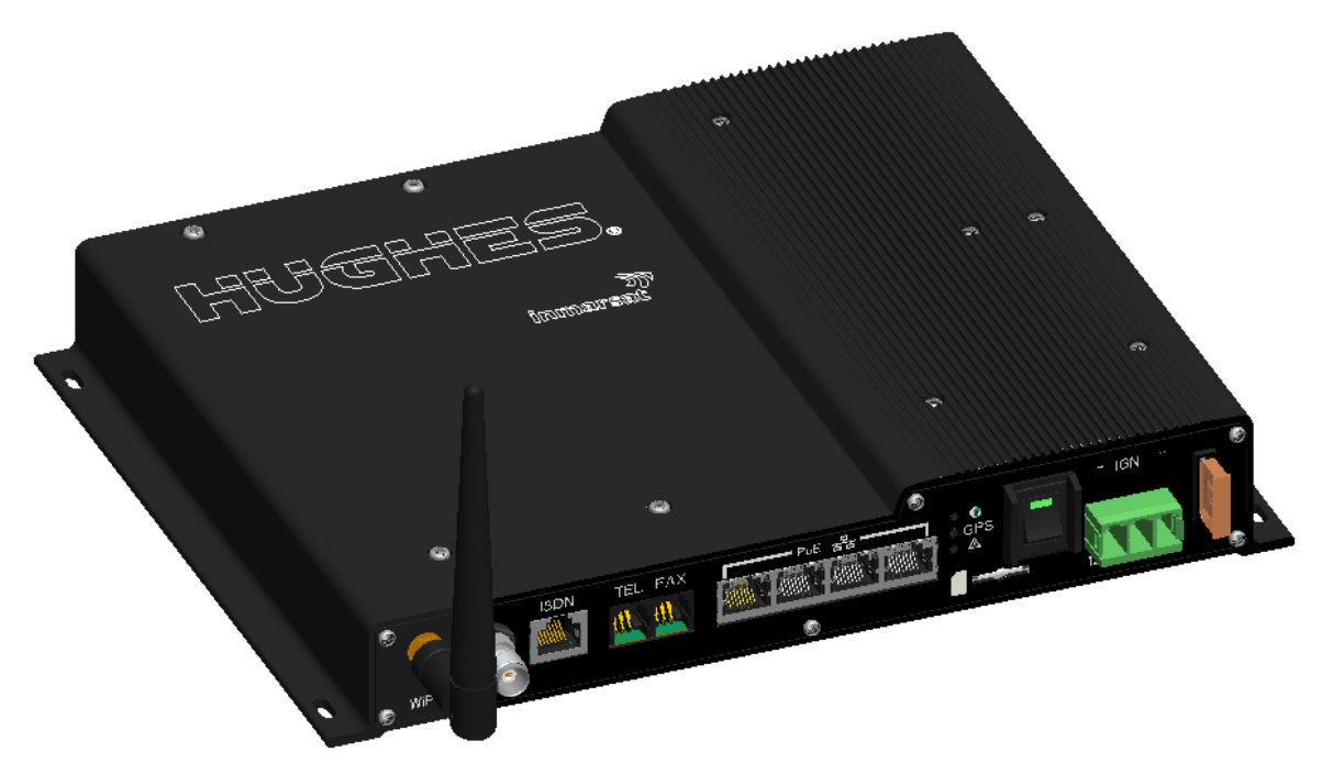
Figure 2. Indoor Unit (IDU)