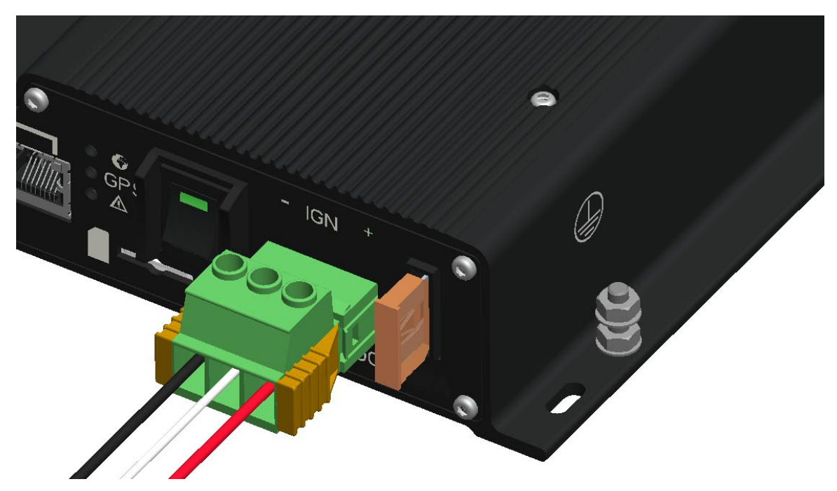
Figure 4. Chassis ground