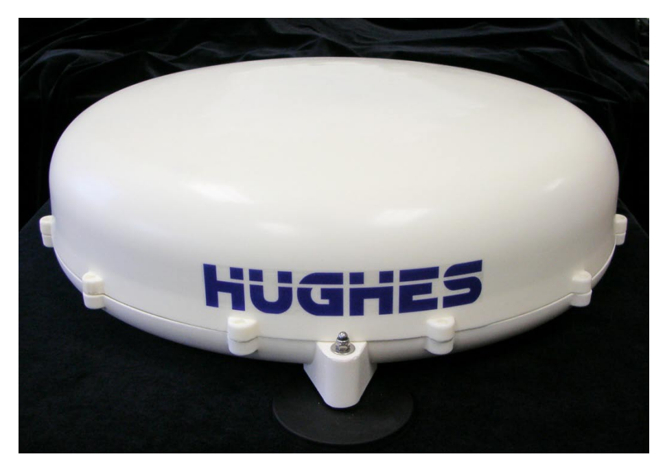
Figure 7. Class 10 antenna Outdoor Unit (ODU) 477 mm X 153 mm height