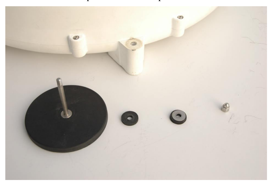
Figure 6. C10 antenna with magnetic mount component parts

First attach the magnets to the antenna. There are three "legs" on the antenna where the magnets are placed. Note the position of the two rubber washers just below and above each antenna "leg," the stainless steel washer above the upper rubber washer, and the protective nut on top.